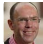
John Hancock Signature Consulting